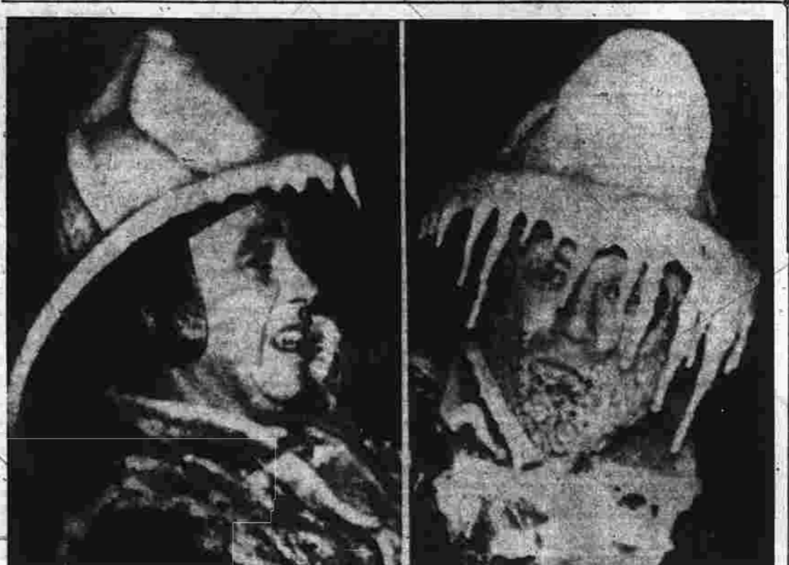
Two frigid Central Falls firefighters look like Frosty the Snowman at fire in unoccupied dwelling here last night. Five families next door to the blaze were forced to flee in below zero weather. Rhode Island and New England had the coldest weather in almost two years with the overnight low at the Hillgrove, R. I. weather station 5 below zero.