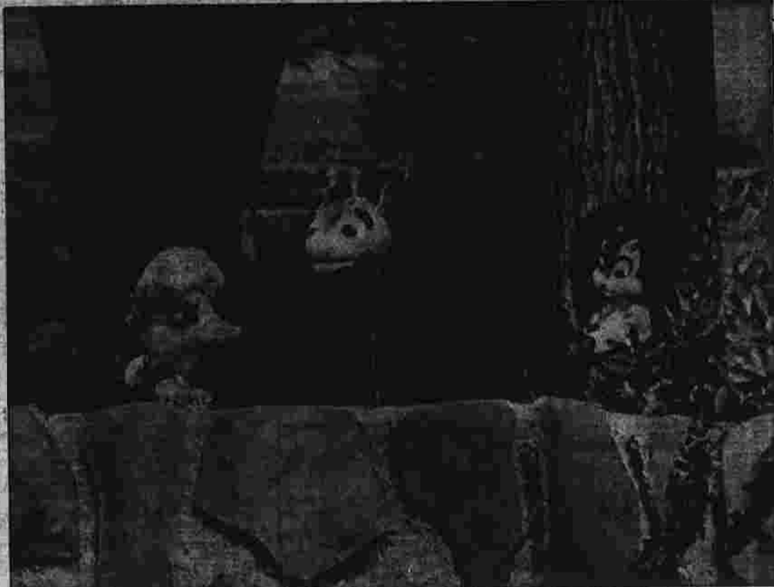
MATH TEACHERS—Ritts Puppets Magnolia Blossom, Sir Geoffrey Giraffe and Albert Chipmunk succeed in putting across with ease fairly complex mathematical concepts on NBC-TV's Saturday forenoon "Exploring" series.

A. In the middle of his junior year he switched from math to drama, and got his B.A. degree in drama in 1952.